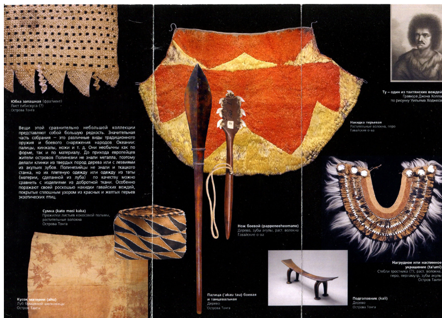
Figure 4.1. Brochure from the MAE exhibition The Last Voyage of Captain Cook , 2002.