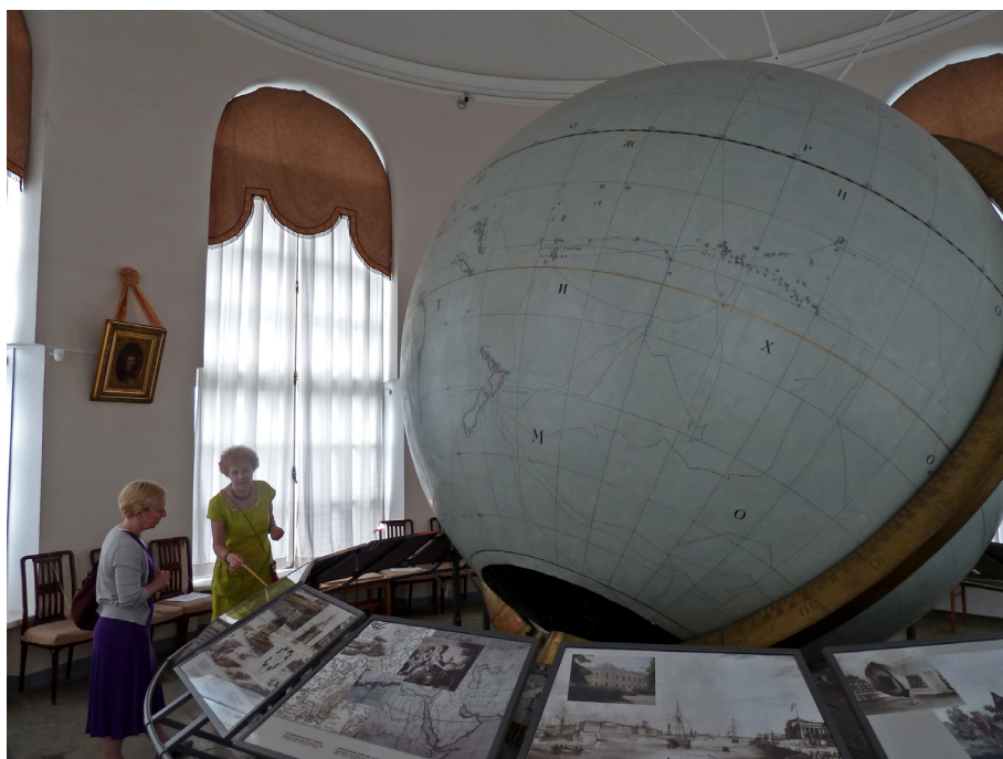
The Gottorp Globe, Museum of Anthropology and Ethnography, St Petersburg 2013.