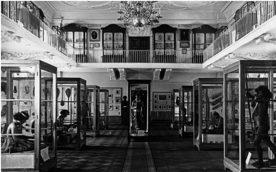
Figure 4.19. Permanent Australia and Oceania exhibition, 1953. Museum of Anthropology and Ethnography, St Petersburg.