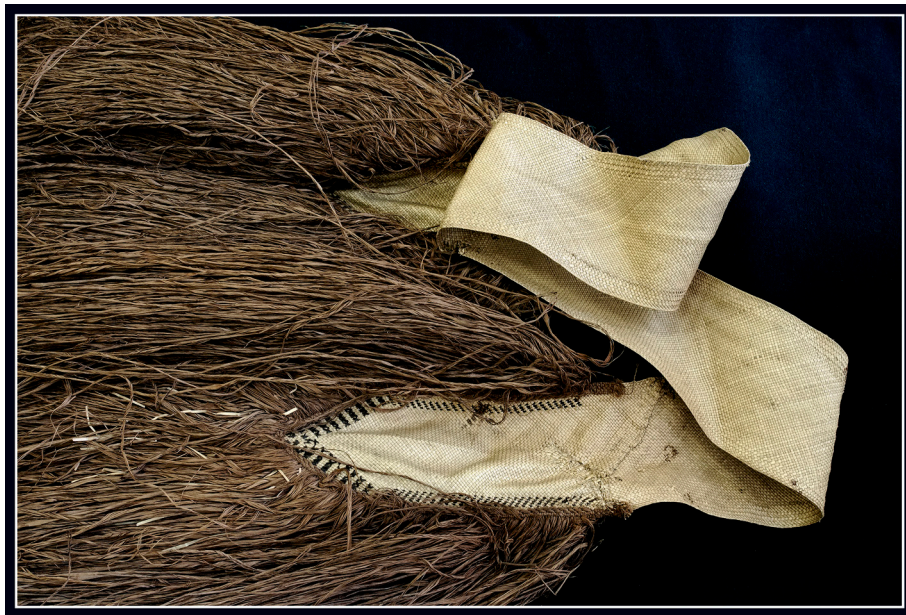
Figure 4.13. Detail of Marshall Islands grass skirt with belt. Kotzebue's collection in Anuchin Research Institute and Museum of Anthropology of Lomonosov Moscow State University (370-8).

The earliest collection in MAMSU is of Lisiansky's artefacts from the Marquesas and Hawai'i; these artefacts are easily identifiable. By contrast, only a few items can be identified from the collection of Kotzebue, including a mogan, a floating device from Rumiantsev (Wotje) Atoll (Figure 4.13). The Museum has a superb collection of Polynesian tapa cloth, mostly unpatterned; it is lacking the original documentation and was later catalogued as Hawai'ian, but might also originate from the Marquesas. In the late nineteenth and early twentieth centuries the South Pacific collections of the museum grew through donations by Russian naval visitors and individual travellers. Among them is the collection of Aleksei Birilev from San Cristobal (Makira) Island (Solomon Islands) (1870) and Vladimir Messer from New Guinea (1872), both of whom visited these places aboard Russian naval vessels. Russian traveller Eduard Zimmerman visited New Caledonia, New Zealand and Hawai'i in 1882 and brought back a large collection of artefacts. Although he probably purchased some from dealers, he wrote that he had bought some artefacts including a dancing mask from a missionary who had lived for a long time in New Caledonia. A large collection assembled by well-known Russian symbolist poet Constantin Balmont, who visited the islands of Polynesia and the south coast of New Guinea in 1912, in search of 'islands of the happy people', is distinguished by the marked aesthetic quality of the artefacts. 294