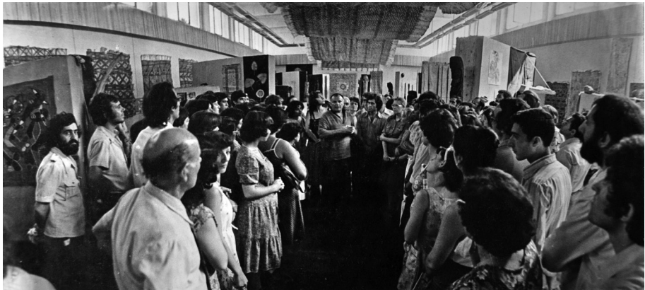
Figure 4.21. Opening of Nicolai Michoutouchkine's exhibition Ethnography and Art of Oceania , 1980, State Museum of Ethnography, Sardarapat, Armenia.

(Museum of Anthropology). They were kept in storage during the Second World War and, until recently, have hardly been exhibited and were barely accessible to researchers. Only in the twenty-first century have the storage facilities for the collections been upgraded, which allowed the curator Ekaterina Balakhonova to conduct further research and organize their first display in the Museum hall of the old university building in the centre of Moscow (Figure 4.20).