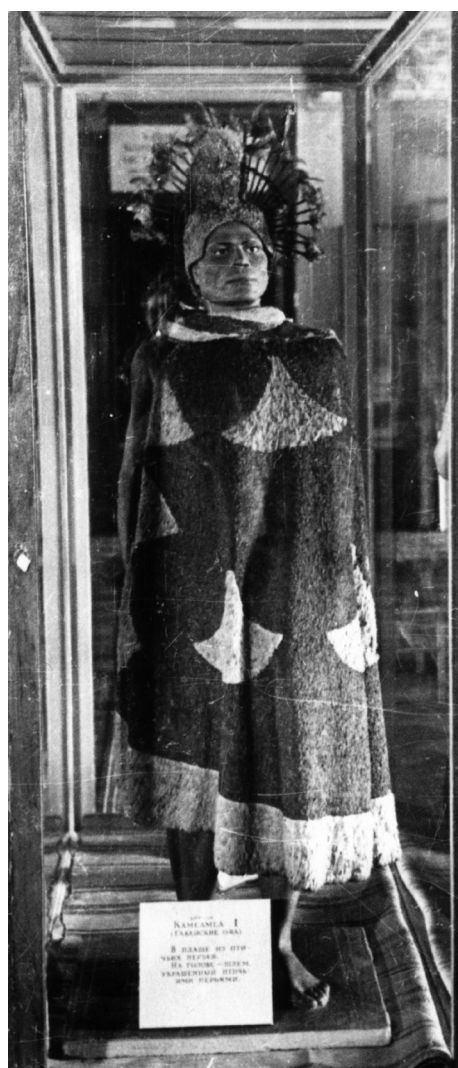
Figure 4.18. Life-size figure of a Hawai'ian in featherwork dress, 1953. Museum of Anthropology and Ethnography, St Petersburg.

During the 1930s the MAE aimed to replace the evolutionary-typological approach dominating the displays with a Marxist-Leninist ideology of class struggle as interpreted through the lens of museum curation, liberating itself from the dominance of 'things'. The result of this were the 1934 'paper' displays Colonial Policy in Oceania and Dutch Imperialism in Indonesia . 299 From 1951 the permanent exhibition on Australian and Oceanic peoples, formed under the guidance of the prominent Soviet ethnographer Sergei Tokarev and later expanded by Nikolai Butinov and Vladimir Kabo, was set in one of the museum's best halls (Figures 4.18 and 4.19). It reflected different aspects of traditional Oceanic culture, featured a number of life-size figures, and was popular with visitors. 300 In 1987 the MAE's Oceanic collections were presented at a major exhibition abroad, Journey to Oceania , in the Taideteollisuusmuseo (Museum of the Applied Arts) in Finland. It included about 600 items and was accompanied by a catalogue, which remains the best pictorial illustration of Russian Oceanic holdings. 301