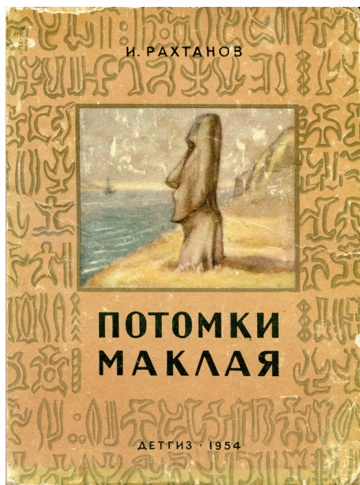
Figure 4.15. Well-read children's book Descendants of Maclay telling Kudriavtsev's story, published in 1954.