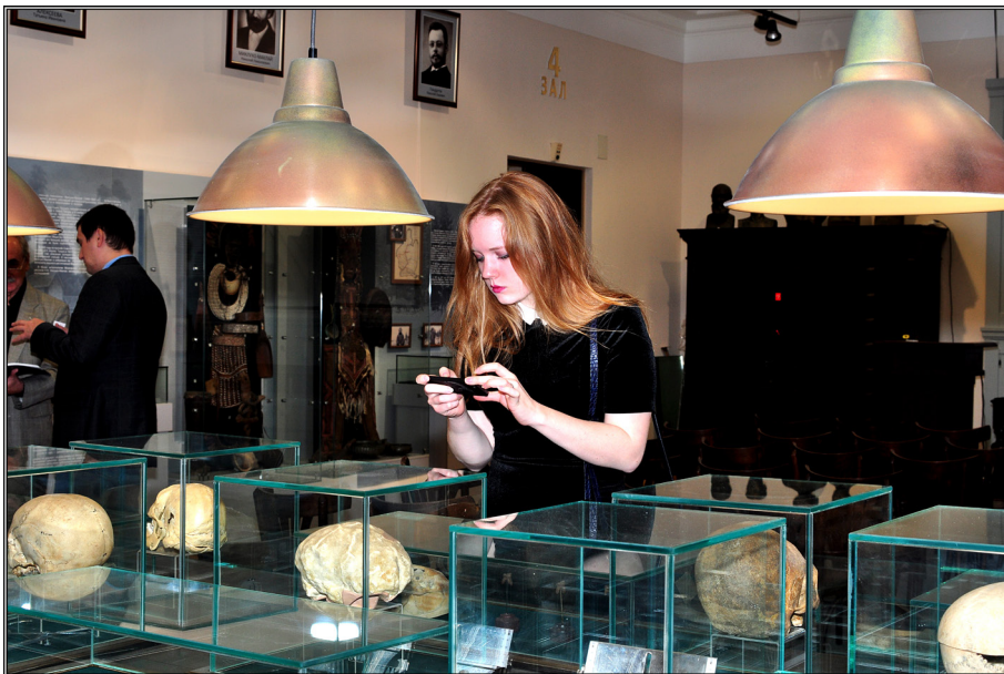
Figure 4.20. Exhibition hall with Oceanic collections in MAMSU.

The South Pacific collections in Moscow were not so lucky. In the 1920s, some of them were displayed as part of the newly established Muzei narodovedenia (Museum of Ethnography); in 1939, as the museum was rebranded as the Muzei narodov SSSR (Museum of the Peoples of the USSR), they were transferred to the Muzei antropologii