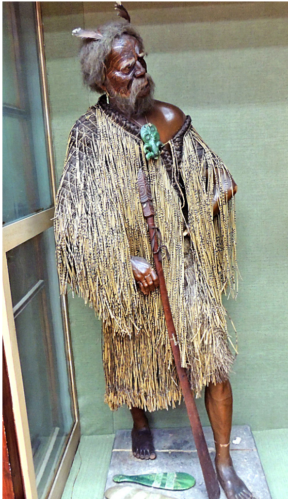
Figure 4.6. Life-size figure of Māori man in traditional dress. Ethnographic Museum of Kazan University.