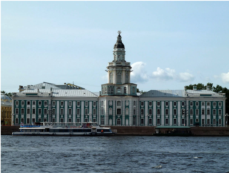
Figure 4.8. Peter the Great Museum of Anthropology and Ethnography, St Petersburg, the main repository of Oceanian collections in Russia.