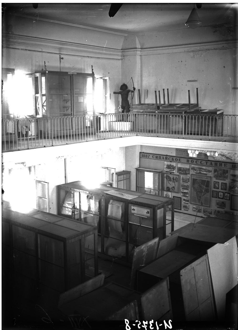
Figure 4.16. Life-size figure of Papuan taken during the Leningrad siege. Museum of Anthropology and Ethnography, St Petersburg.

Despite numerous political upheavals, the Oceanic collections of MAE continued to grow. In the first years after the revolution, when contacts with the West had not been completely limited, it received a large South Pacific collection from Etnografiska Museet Stockholm (Stockholm Ethnographic Museum) (fond 3117). At the same time, as all collections came into the possession of the state, inter-institutional transfers became