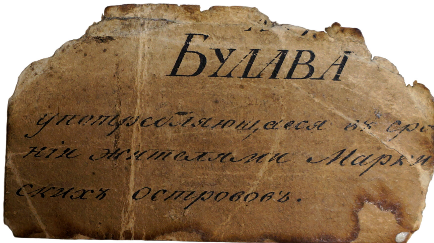
Figure 4.3. State Admiralty Department Museum's label for 'u'u, which reads 'Club, used in battle by the inhabitants of the Marquesas Islands'. Museum of Anthropology and Ethnography, St Petersburg (inventory books).