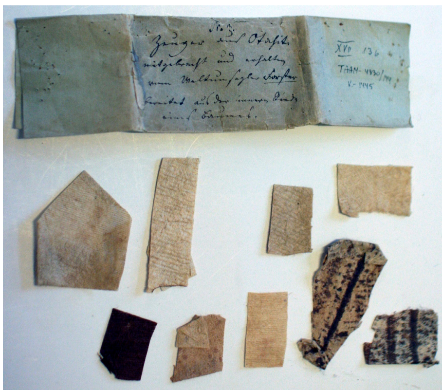
Figure 4.7. Samples of Tahitian tapa attributed to Forster and its original packaging. Estonian Historical Museum (K 1445).