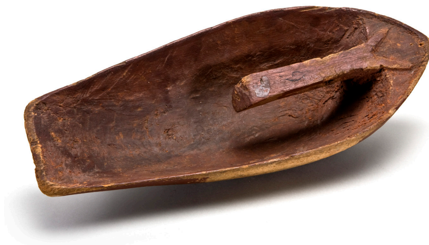
Figure 4.4. Carolinean water bailer made from one piece of wood, Lutke expedition collection. Museum of Anthropology and Ethnography, St Petersburg (11-272).

Some collections of Russian South Pacific voyagers were deposited in this museum soon after the return of their expeditions. This was done, for instance, by Lisiansky and Krusenstern; later some gifts were deposited by the expedition's naturalist Wilhelm Tilesius. In 1831 the museum received the large Caroline Islands collection of Friedrich Lutke (Fedor Litke), numbering 348 objects. 'The collection is so complete', wrote its curator Julia Likhtenberg, 'that it provides an account of the Carolineans' life in the early 19th century' 257 (Figure 4.4). But the destiny of most other collections of the voyagers was not so straightforward, as